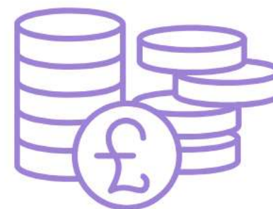
Funds & Wealth Management